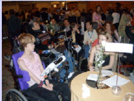
CSUN and USSAAC participants

The "town hall" meeting for people with significant communication disabilities and their allies during USSAAC.